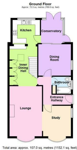
Total area: approx. 107.0 sq. metres (1152.1 sq. feet)